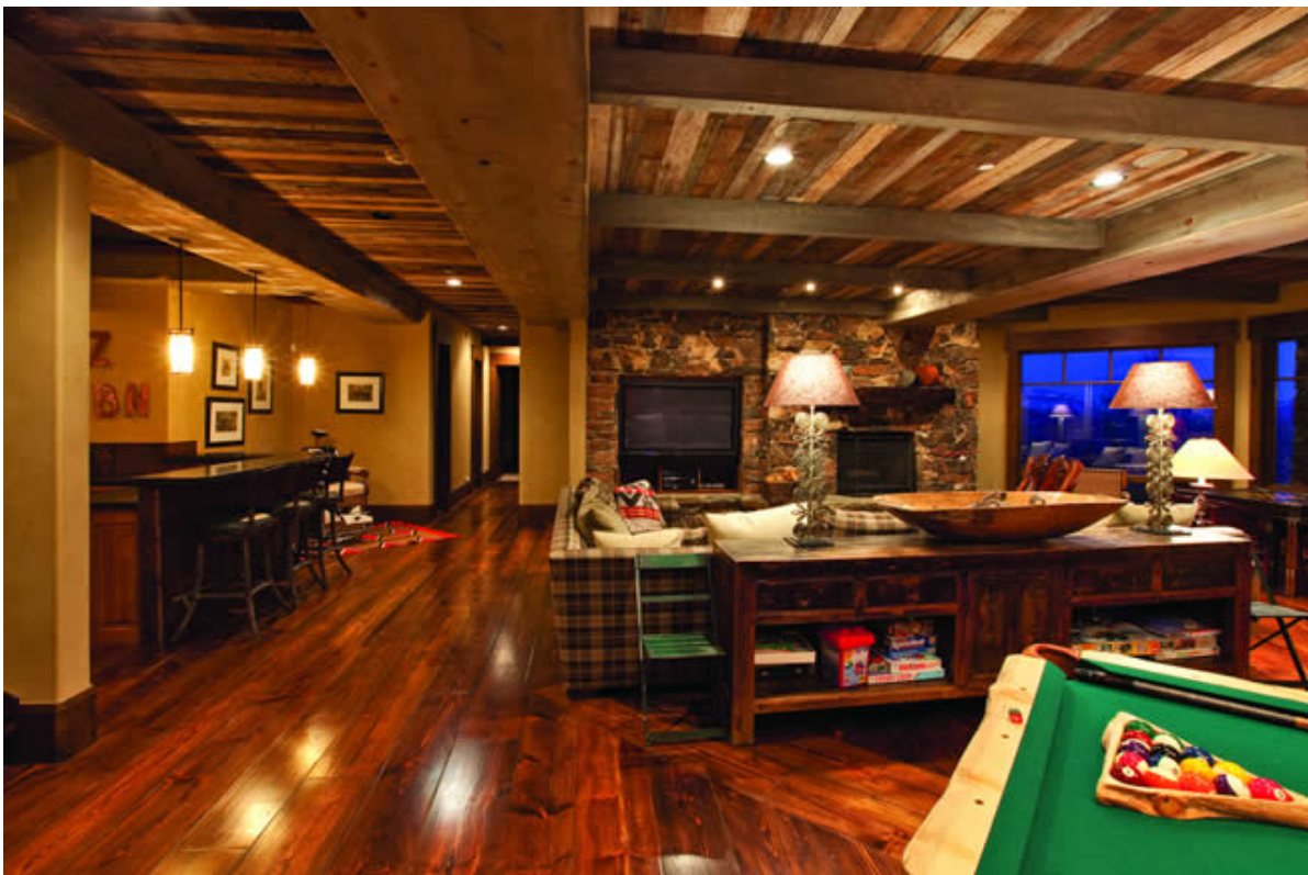
Living Area View