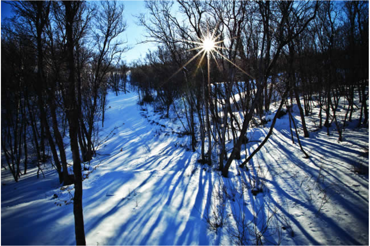
Outside Ski In