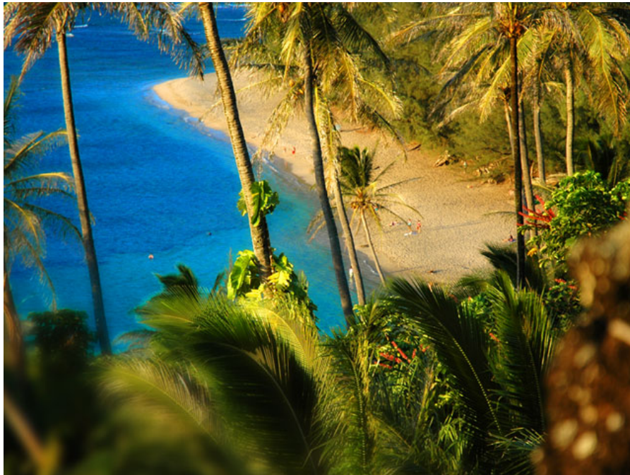
View of Beach