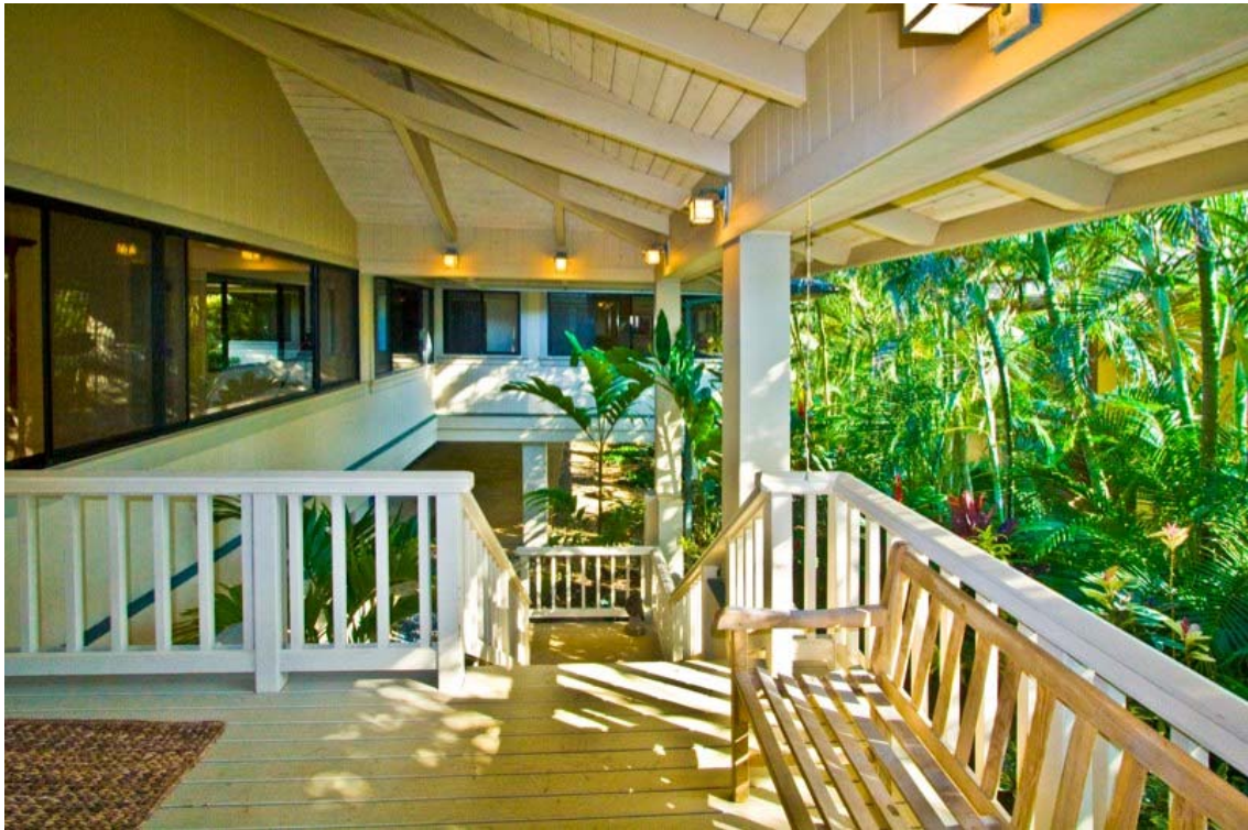
Stairs to Beach Path