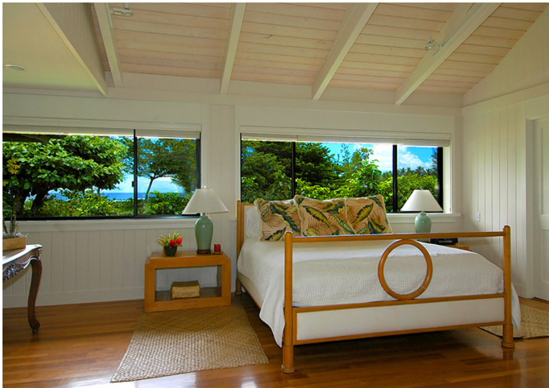
Guest Suite I