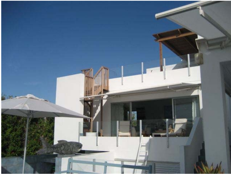
Side of House