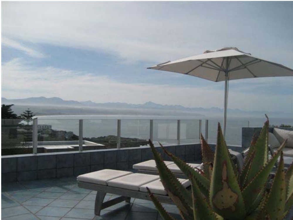
Patio View of Ocean