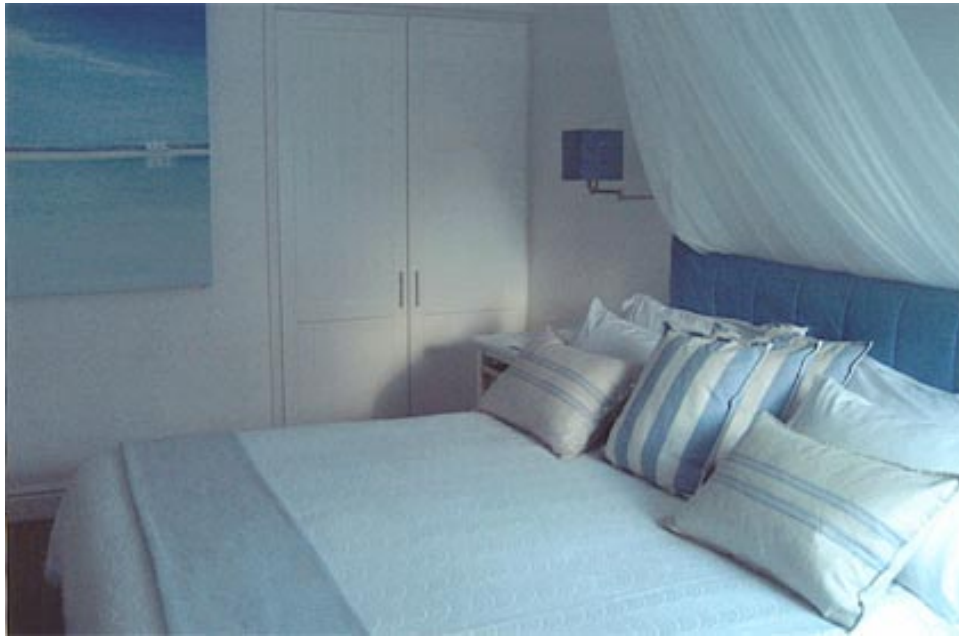
Guest Suite II