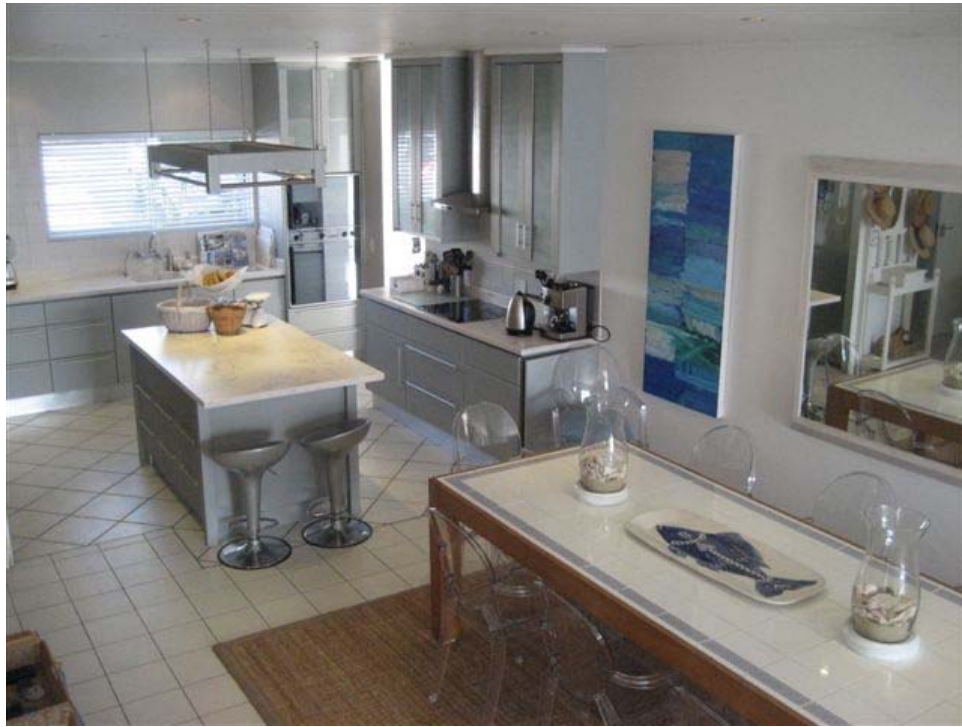
View of Kitchen