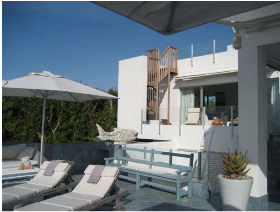
Alternate View III

Rates: (all prices in Rand - visit www.XE.com for conversion)