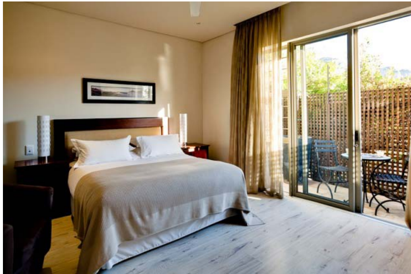
Guest Suite II