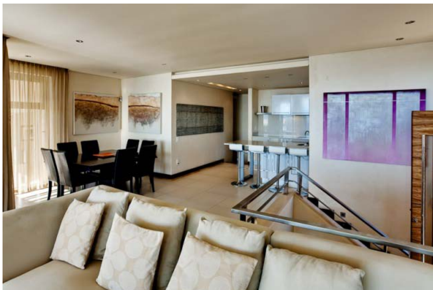
Dining & Kitchen Area