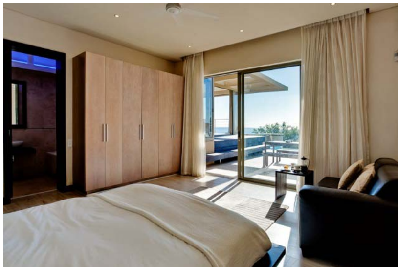
Guest Suite I