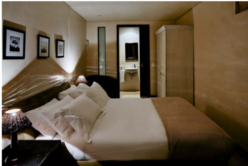
Guest Suite IV