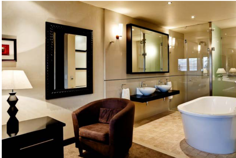
Master En-suite Bath