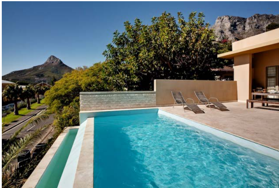
Pool (Alternate View)

Rates: (all prices in South African Rand (ZAR) - visit www.XE.com for conversion)