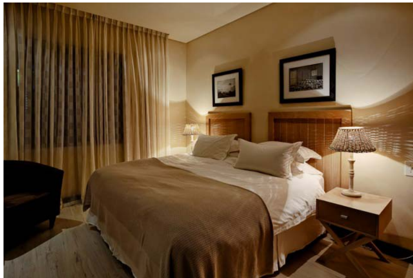
Guest Suite III