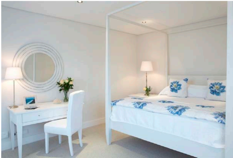
Guest Suite III