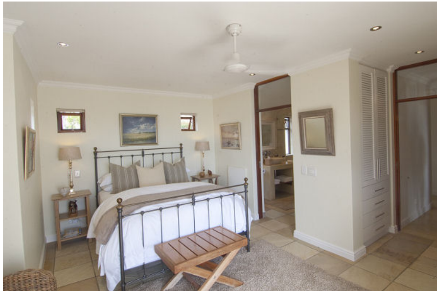
Guest Suite V