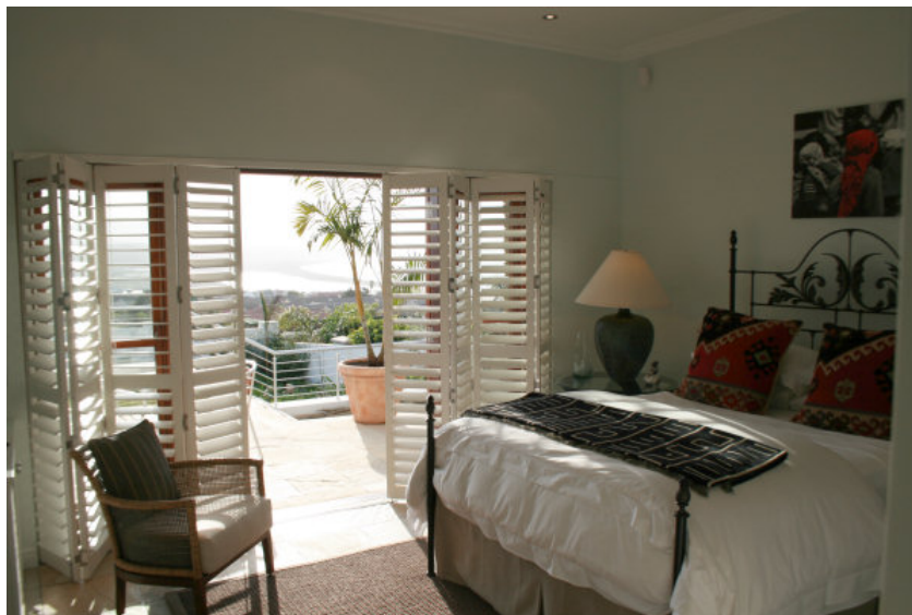
Guest Suite III