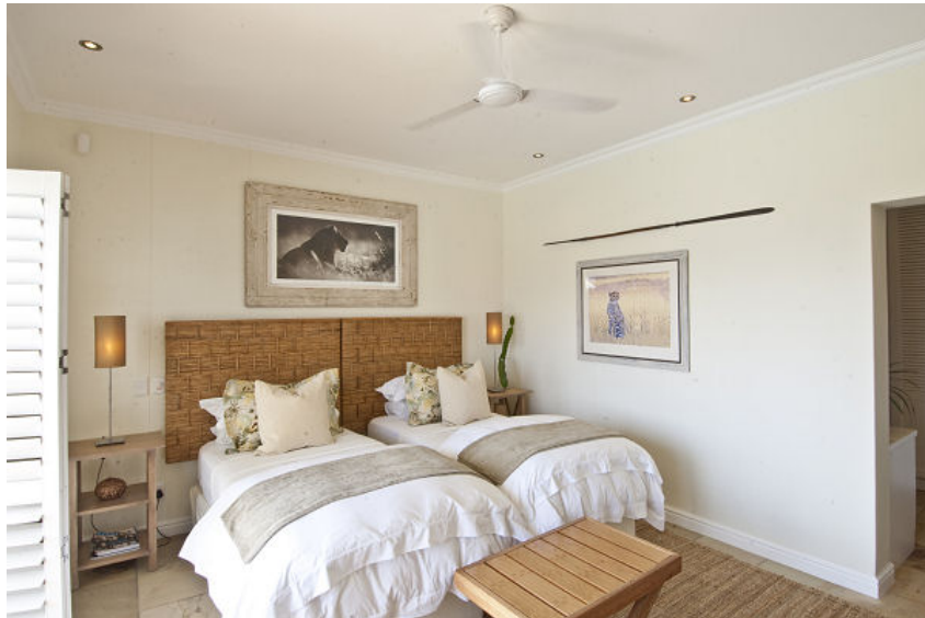
Guest Suite II