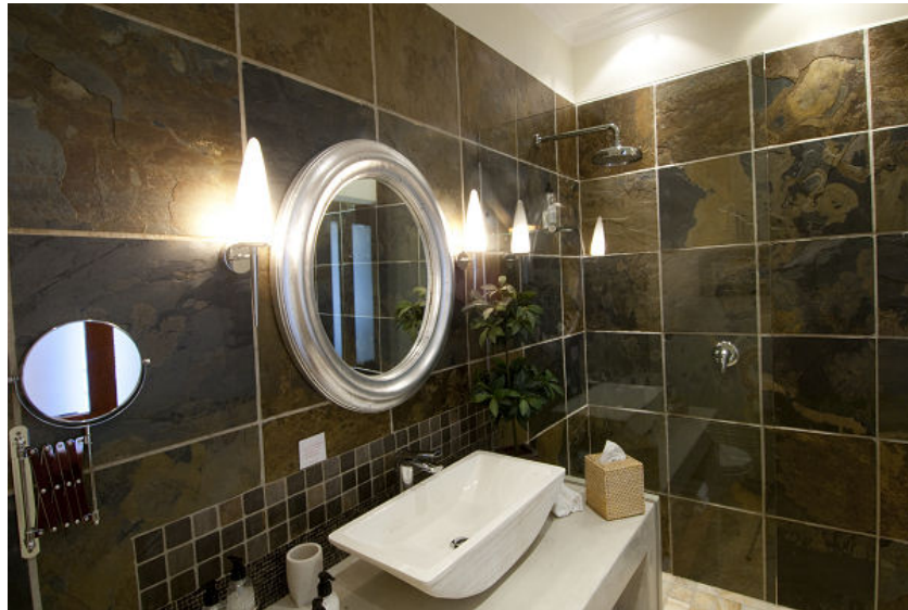
Guest Bathroom II