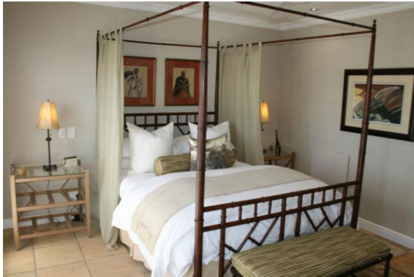
Guest Suite IV