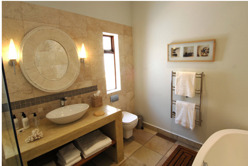
Guest Bathroom III