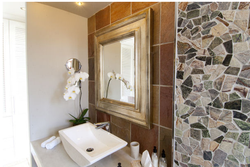
Guest Bathroom IV