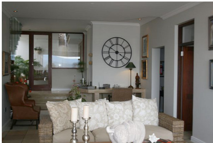
Superior Room (Alternate)