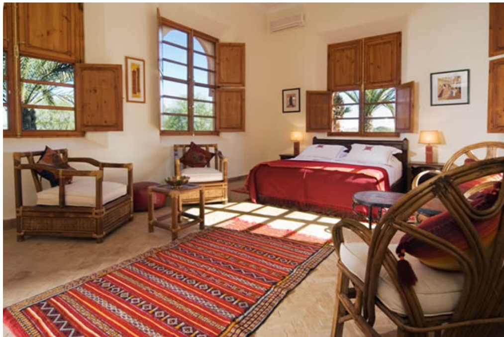
Guest Suite II