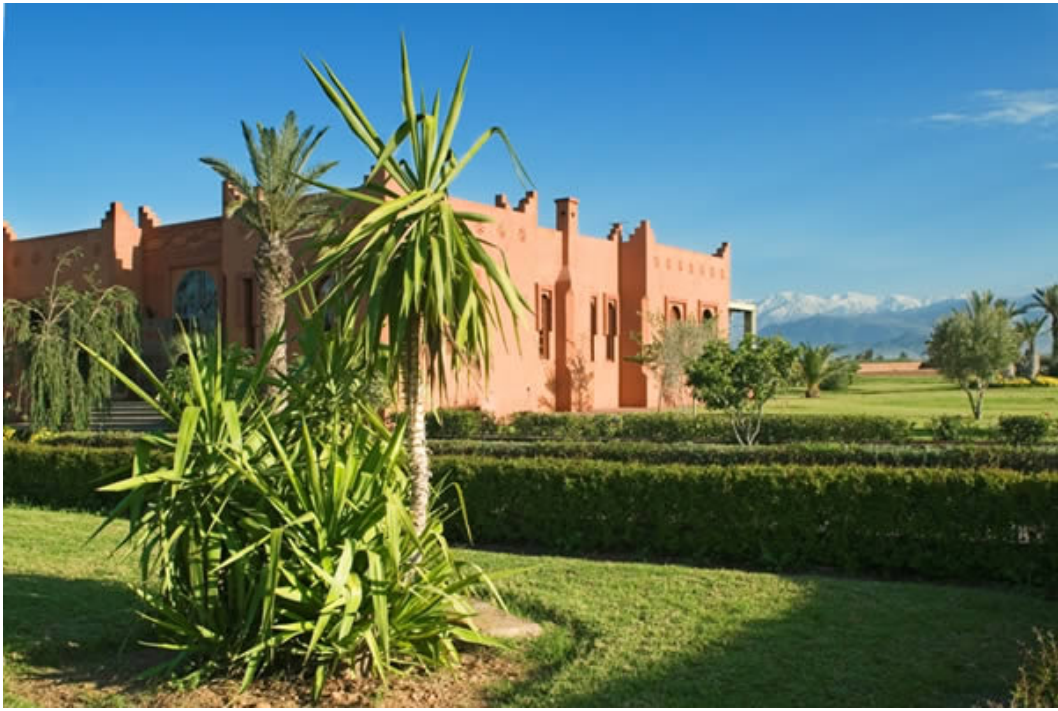
View of Courtyard