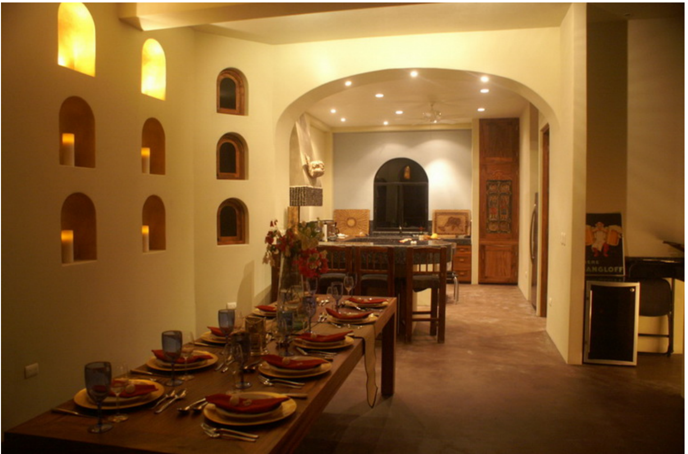
Kitchen & Dining Table