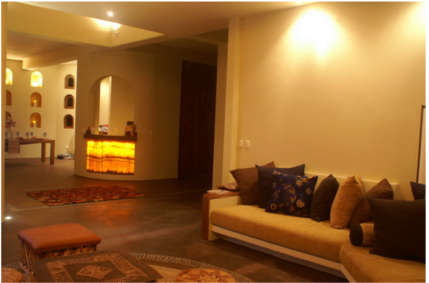
Bar & Living Room