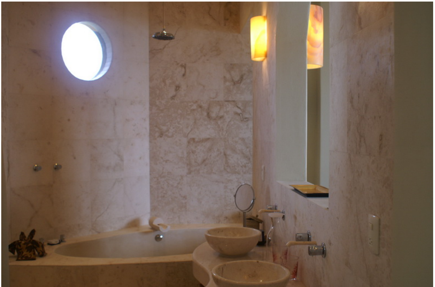
2 nd Master Bath