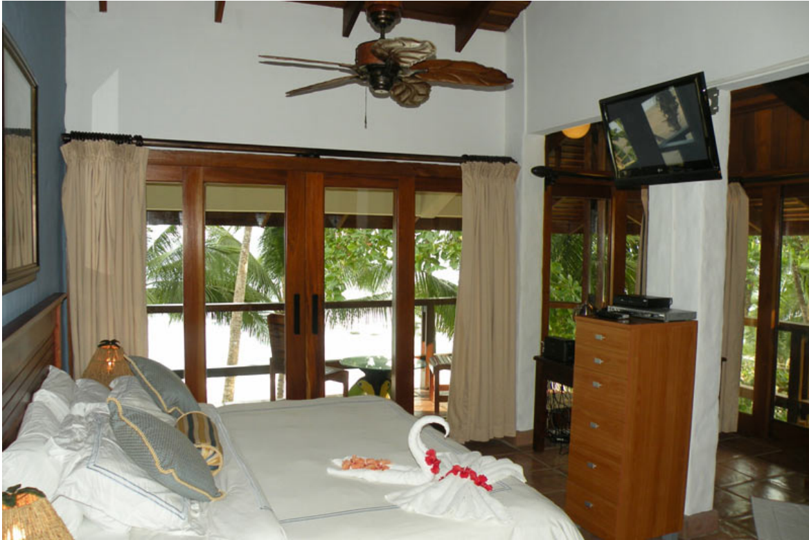
Guest Suite III