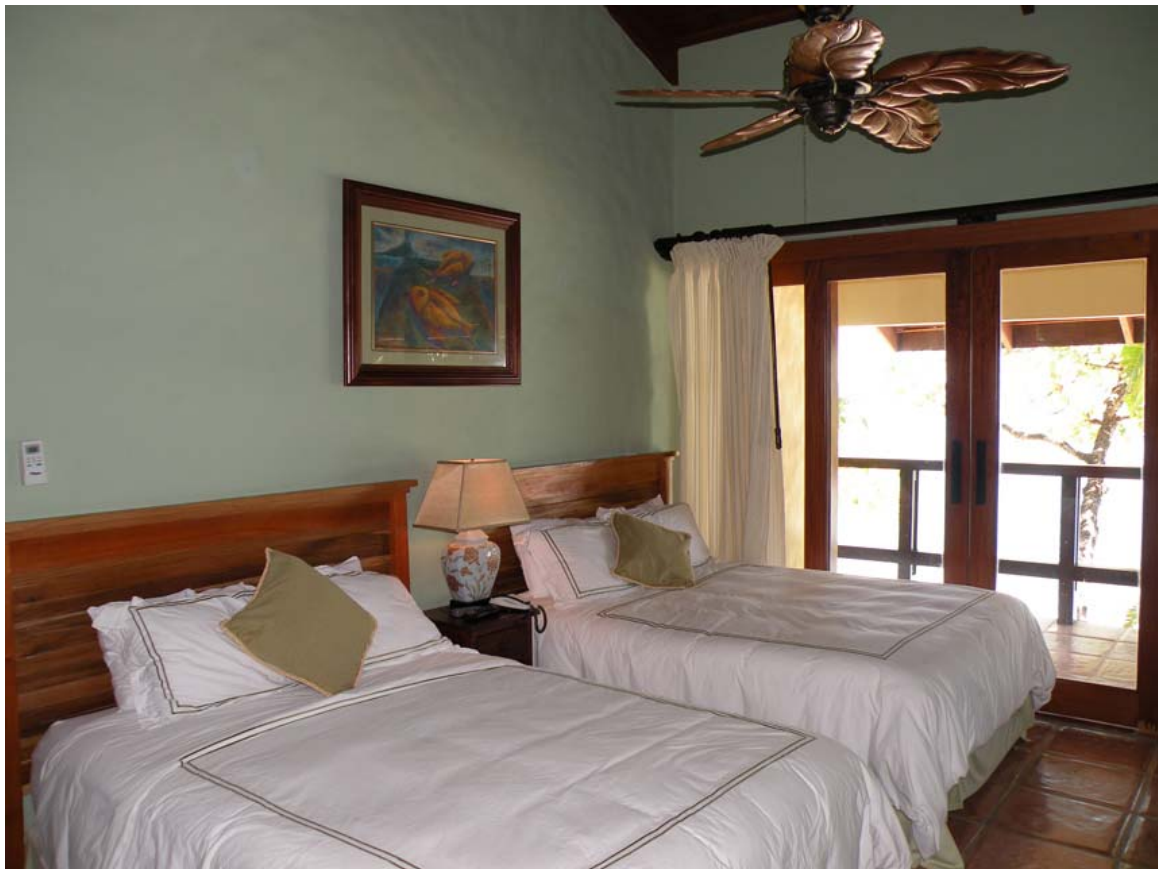
Guest Suite IV

For more information call Dreamexoticrentals.com at 786-293-9061 if dialing internationally please dial 00 +