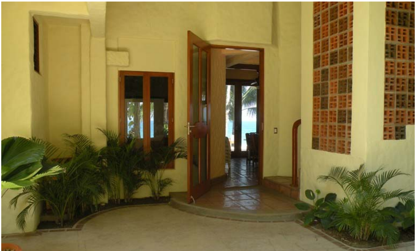
As you enter

For more information call Dreamexoticrentals.com at 786-293-9061 if dialing internationally please dial 00 +