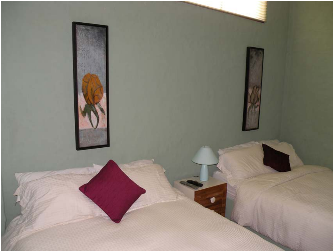
Guest Suite V