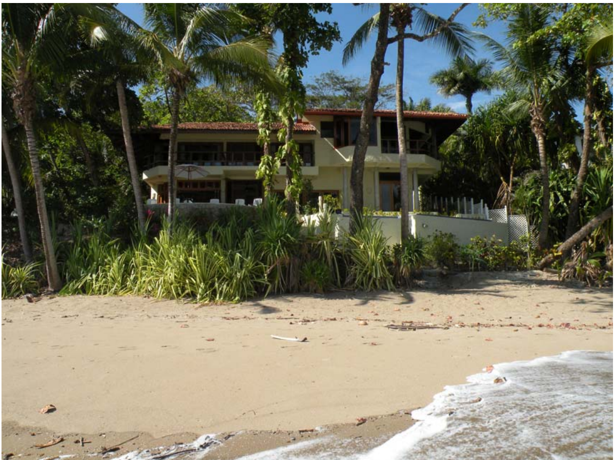
House from Beach

For more information call Dreamexoticrentals.com at 786-293-9061 if dialing internationally please dial 00 +