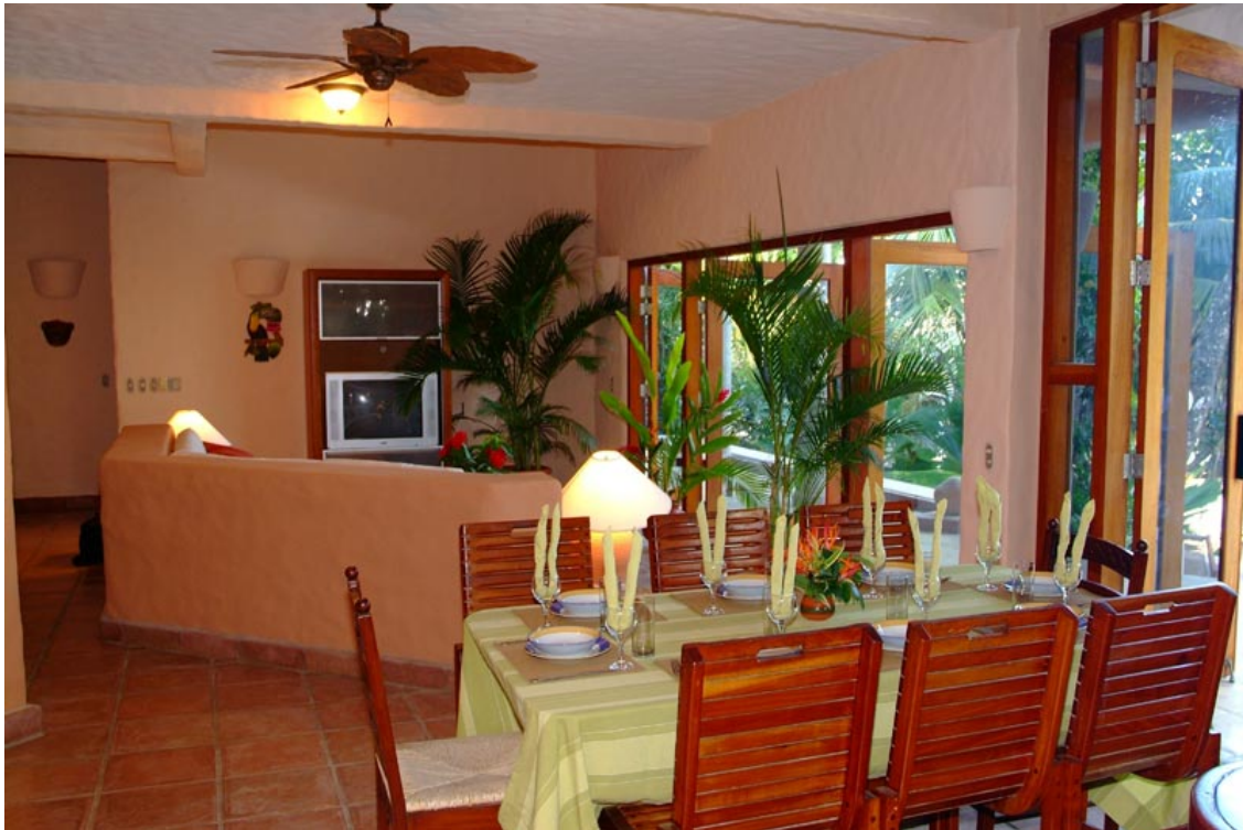
View of Dining Area