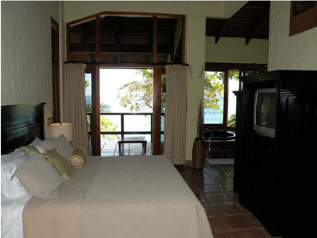
Guest Suite II

For more information call Dreamexoticrentals.com at 786-293-9061 if dialing internationally please dial 00 +