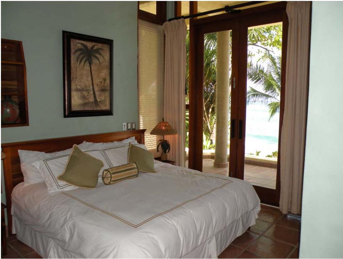
Guest Suite I