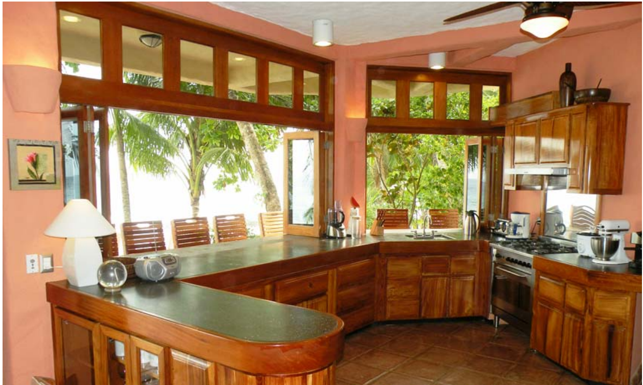
Large Open Kitchen