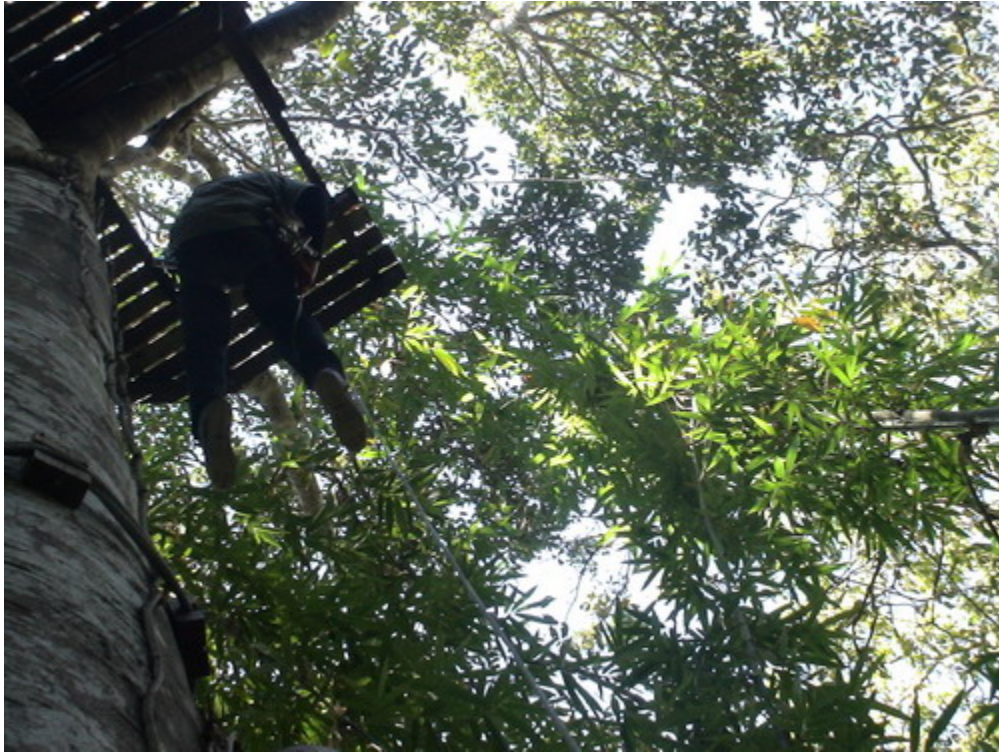
Flying through the Treetops

Flight of the Gibbon is one of Chiang Mai's newest and best eco-tour destinations. Once more it is a mere 30 minute drive from Lanna Hill House.