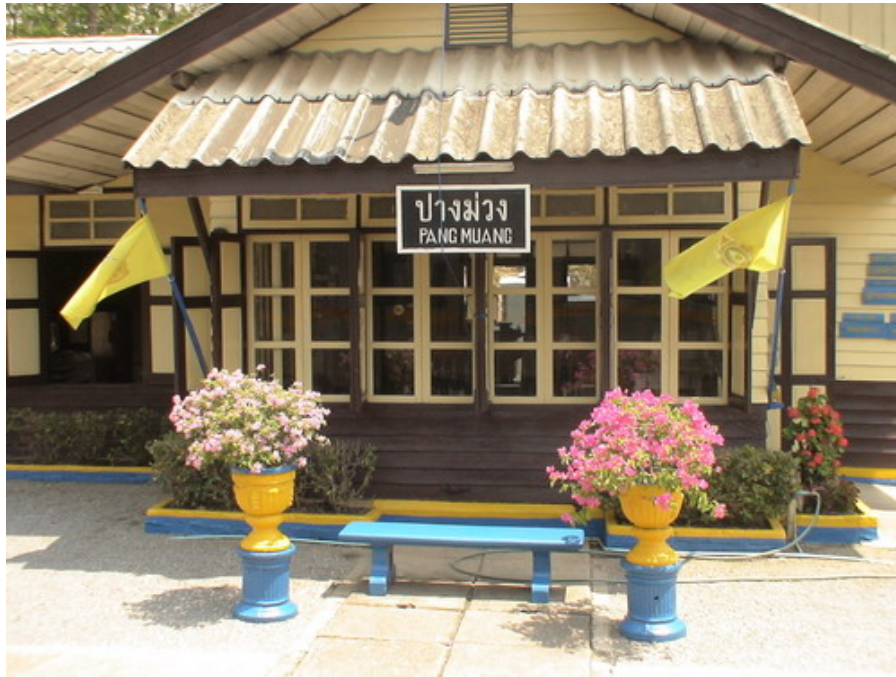
A Train Journey to Yesteryear

In many countries the romance of train journeys has been lost. They're expensive and the experience can be somewhat sanitized. Not so in Thailand. The trains are rickety, a little slow and you can even open the windows. Everyone seems to be having fun and even if your kids are screaming no-one will hear them, as the din is just too loud! What is more, a ticket from Chiang Mai to Lampang is a mere 30 bht (50p, $1).