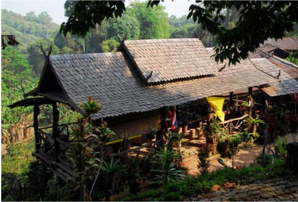
Coffee Shop on top of Mountain

Christmas day 2006. We decided to load up the car with a few goodies for disadvantaged hill tribe kids and embark on a good deed run. We targeted the Hmong village at the summit of Doi Suthep. As we neared the top the covered road became dirt track and we wondered if we would ever find the village. Then we approached a magical scene: A coffee shop perched on the side of the mountain, overlooking a plantation and Chiang Mai. The skies were blue and it was a very cool 15c.