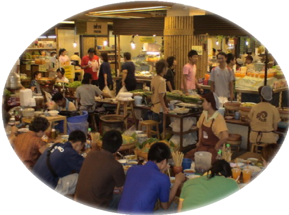
The Northern Village Food Market

You would not normally associate a bustling food market with a covered air conditioned shopping centre, but there is one in Chiang Mai. Located in the Airport Plaza shopping center on the ground floor underneath the Northern Village (one of the best places to find quality souvenirs) is a collection of food stalls where you can enjoy an extremely good value meal (you shouldn't need to pay more than $1 a head for any one dish) or buy locally produced delicacies, that make great gifts or perfect snacks for picnics and take home meals.