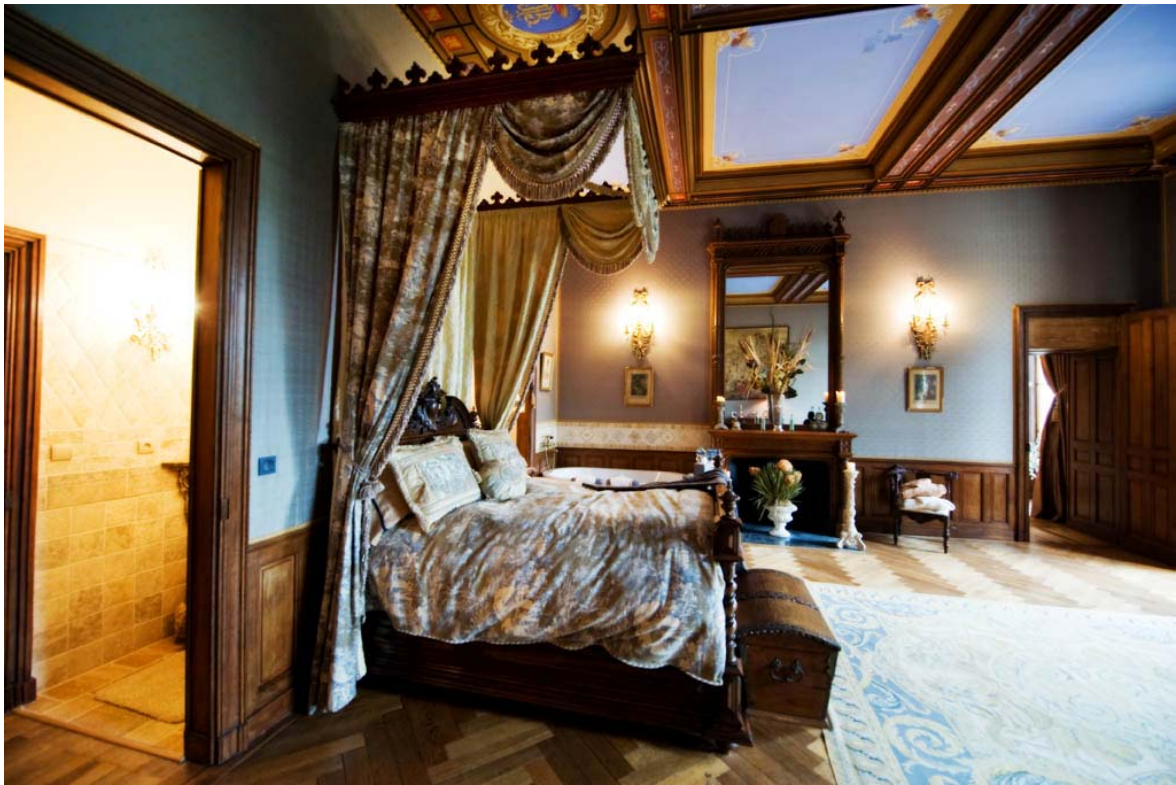
Guest Suite Luxury