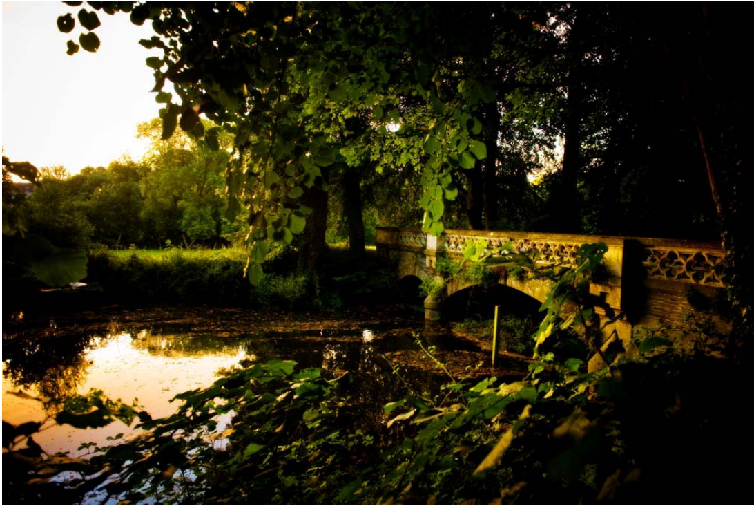
Majestic Castle Grounds