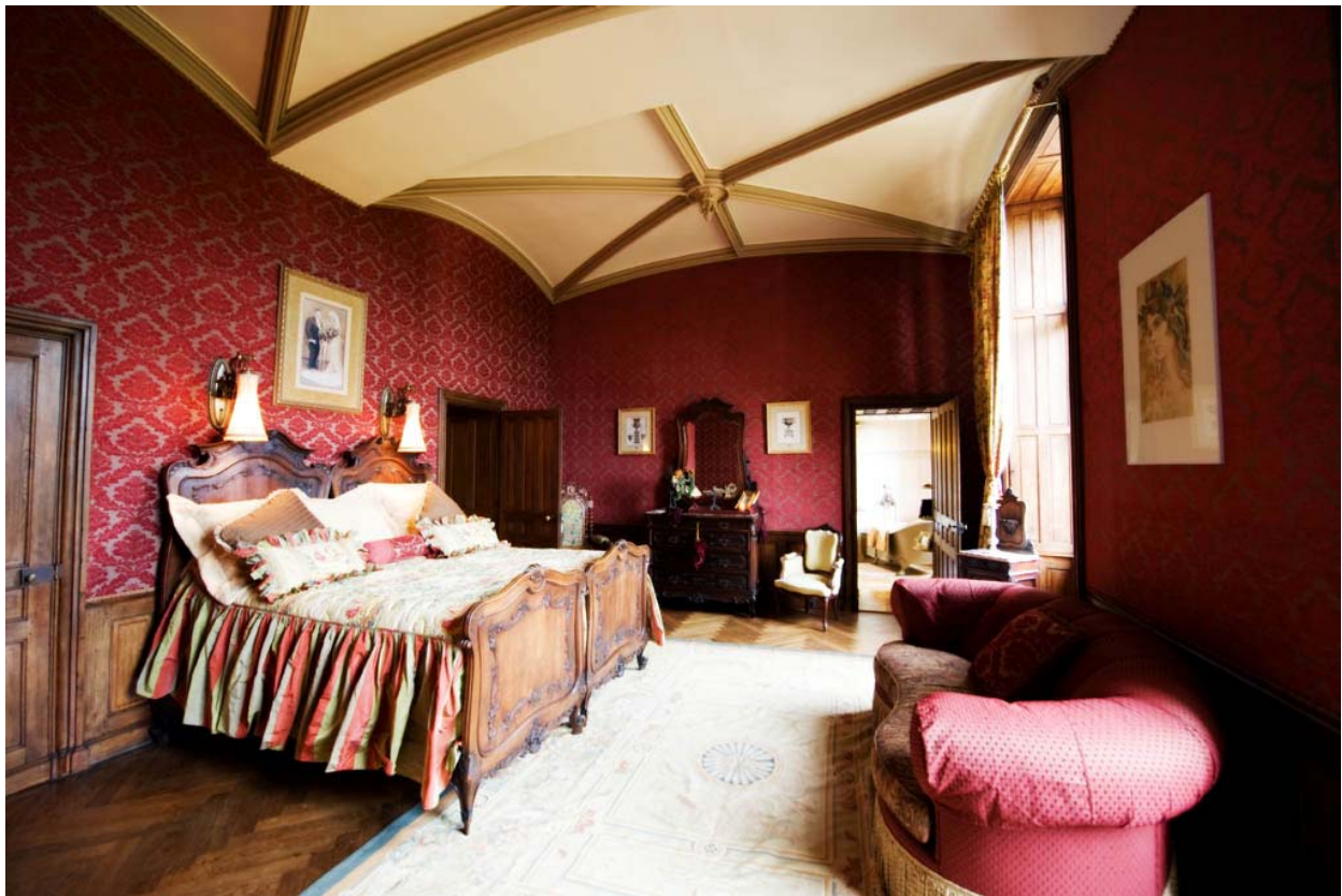
Guest Suite Luxury