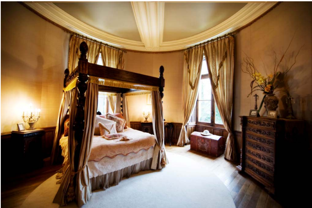
Guest Suite Luxury