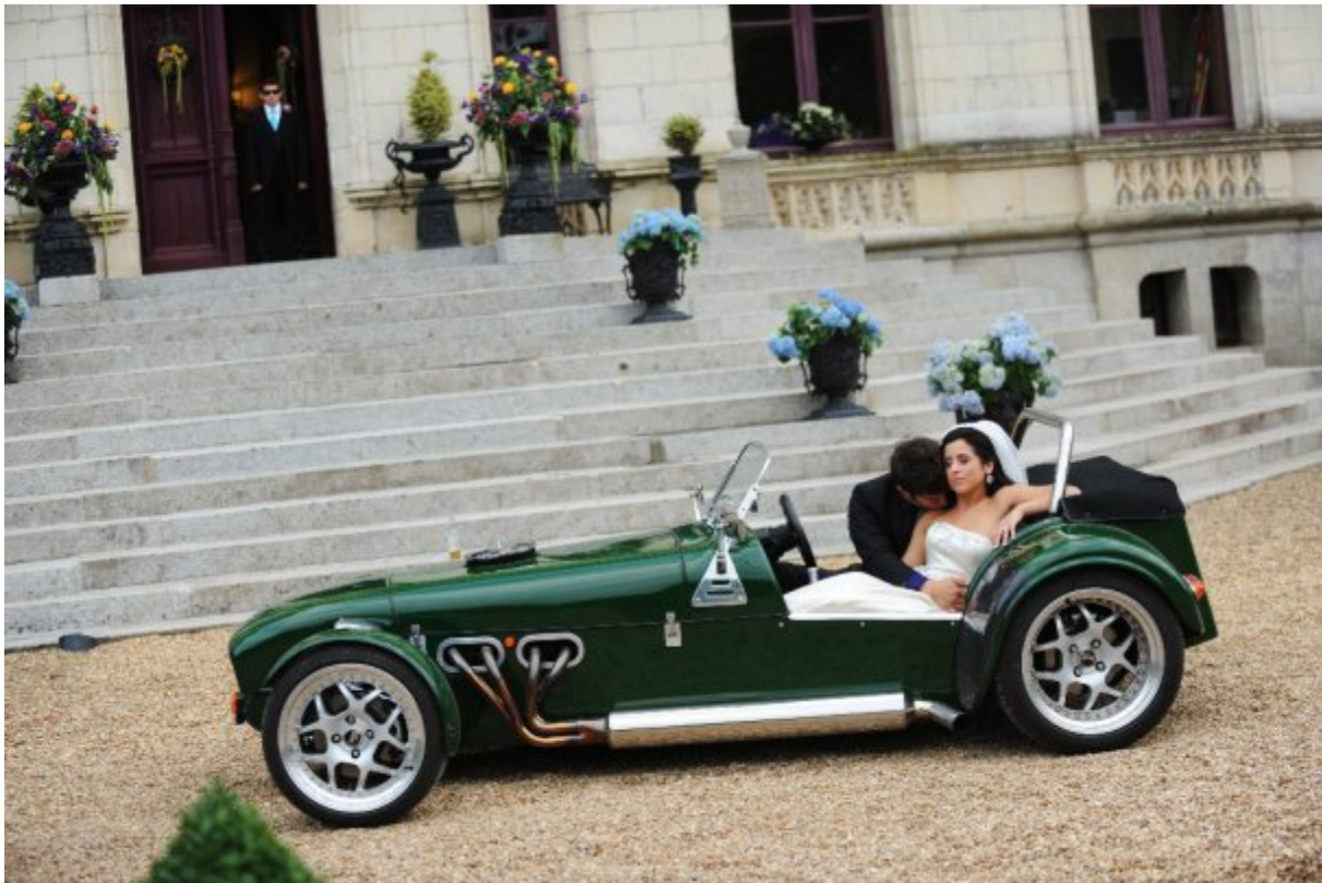
Wedding Photo I