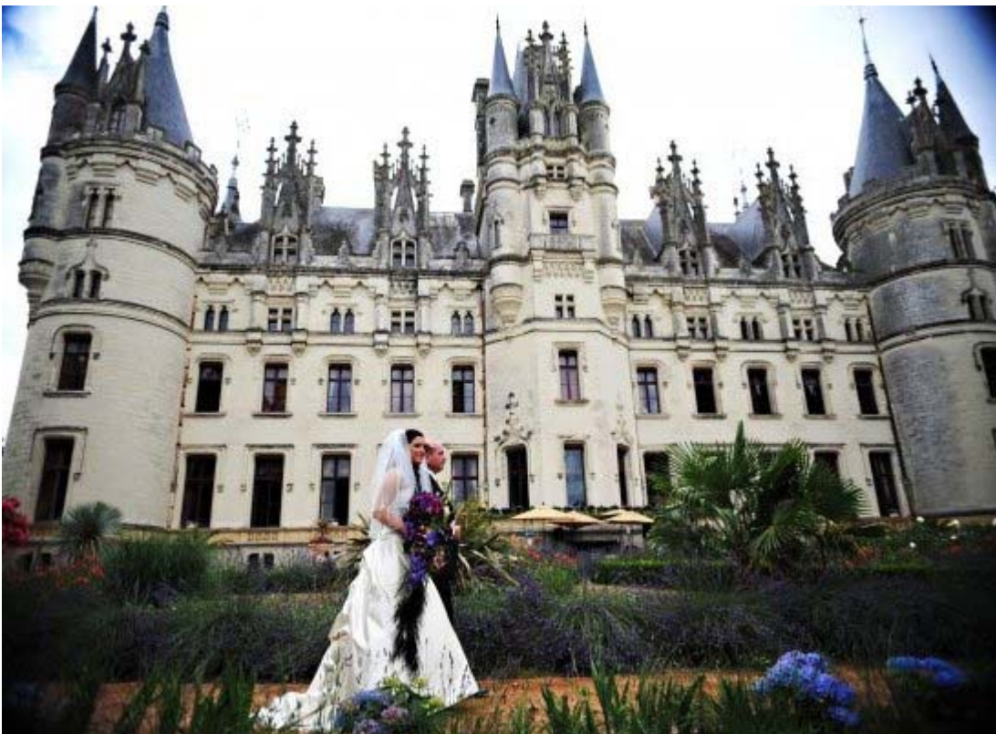
Wedding Photo II