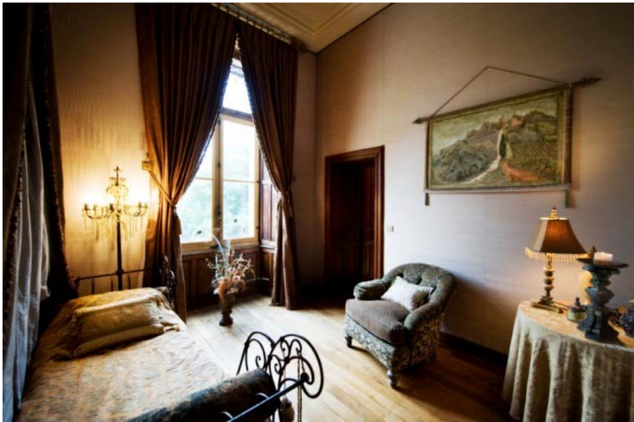
Guest Suite Single