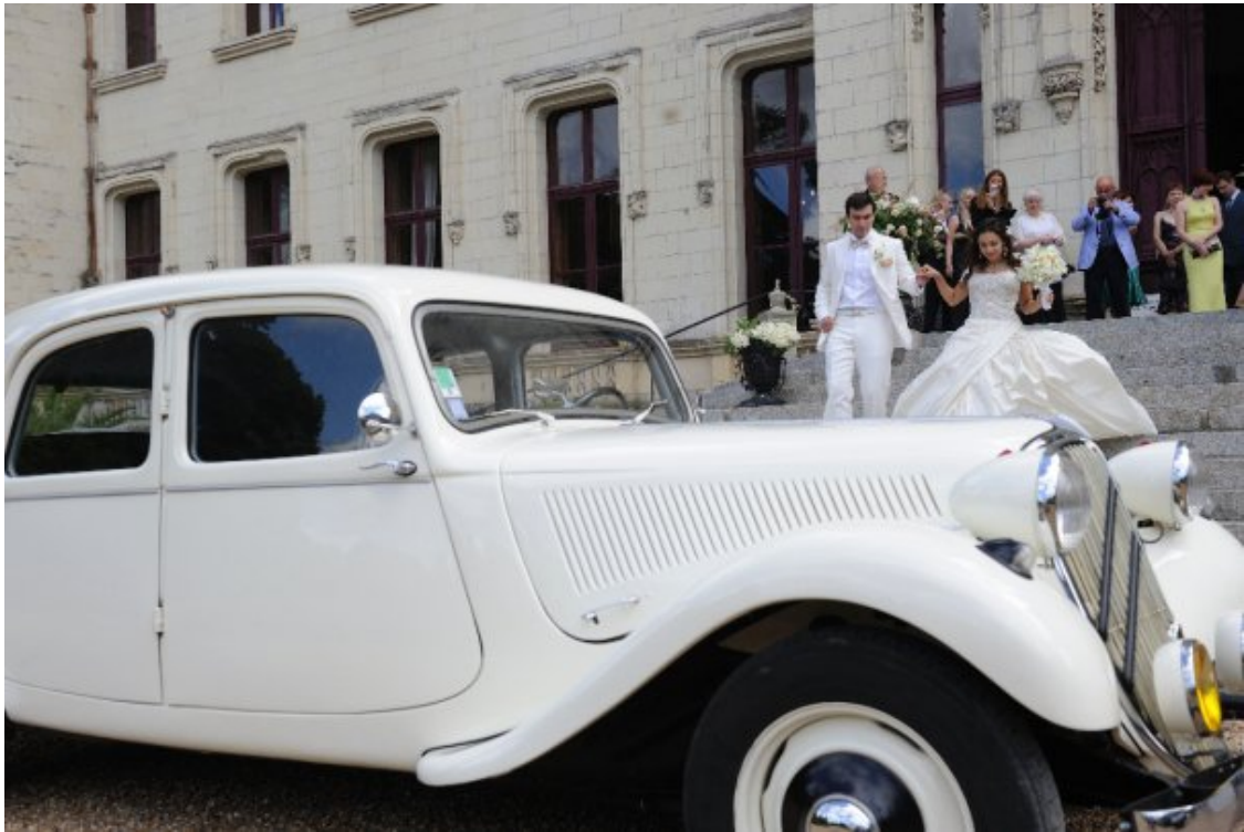
Wedding Photo III