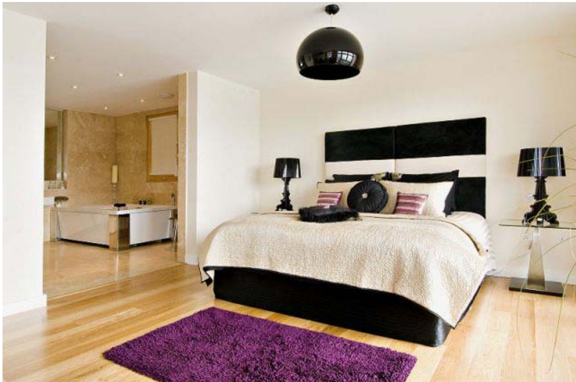
Guest Suite II