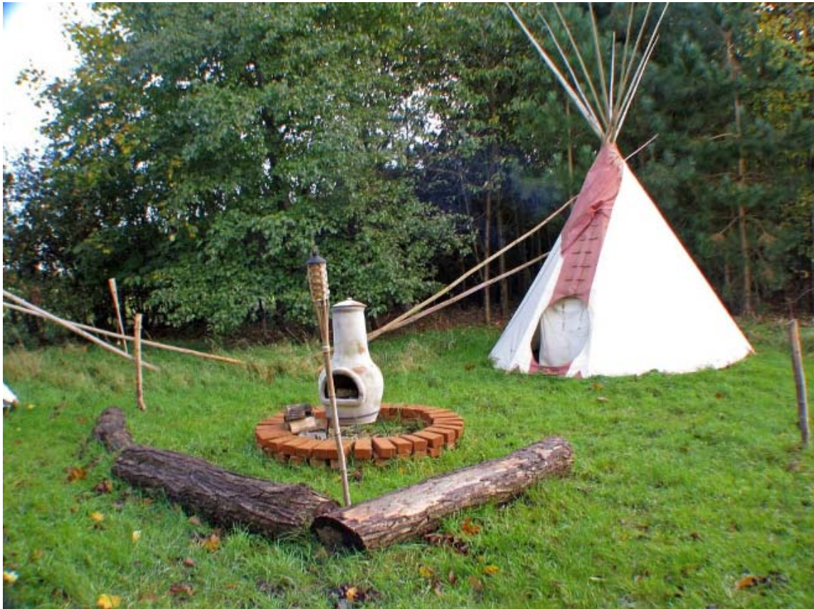
Tiki Hut on Grouds