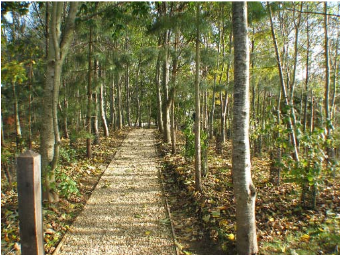
Path Around House