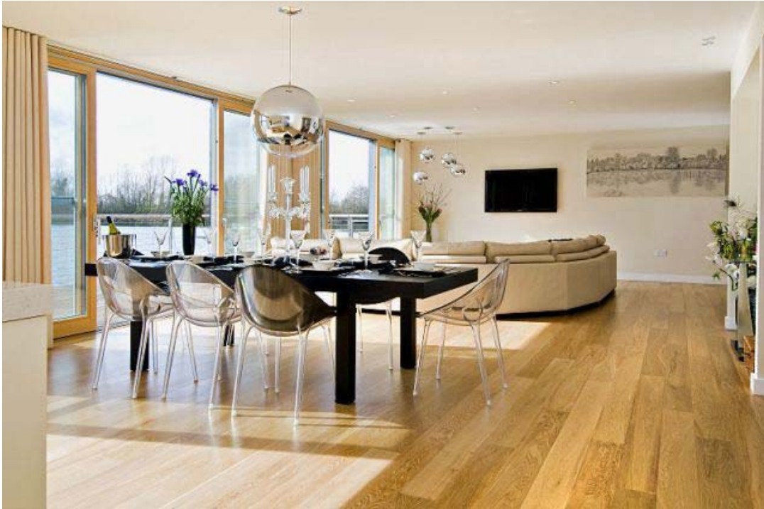
Living area with View