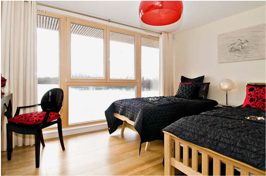
Guest Suite III