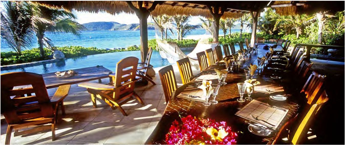
Outside Dining (Beach Pavilion)