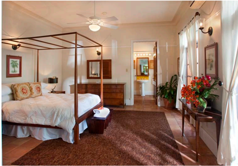
Guest Suite III