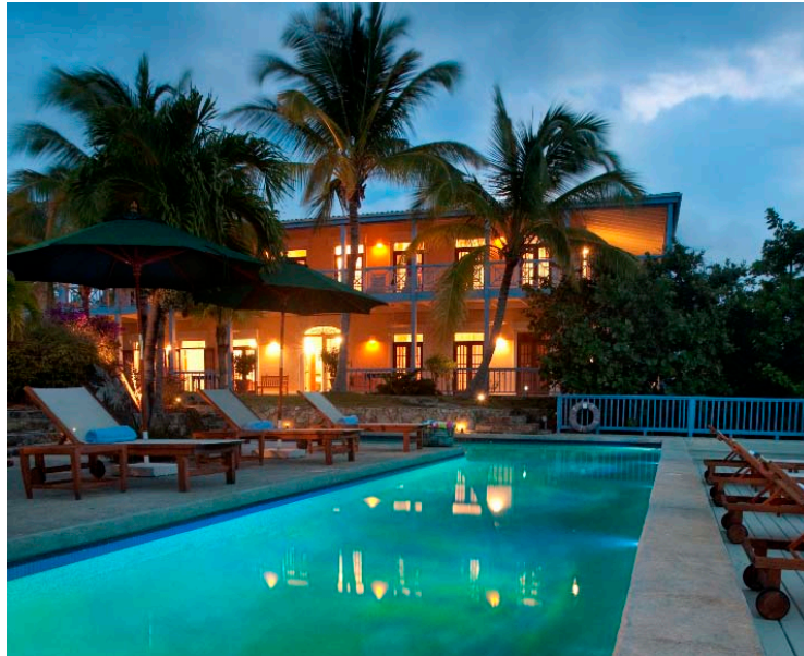
Alternate Pool View