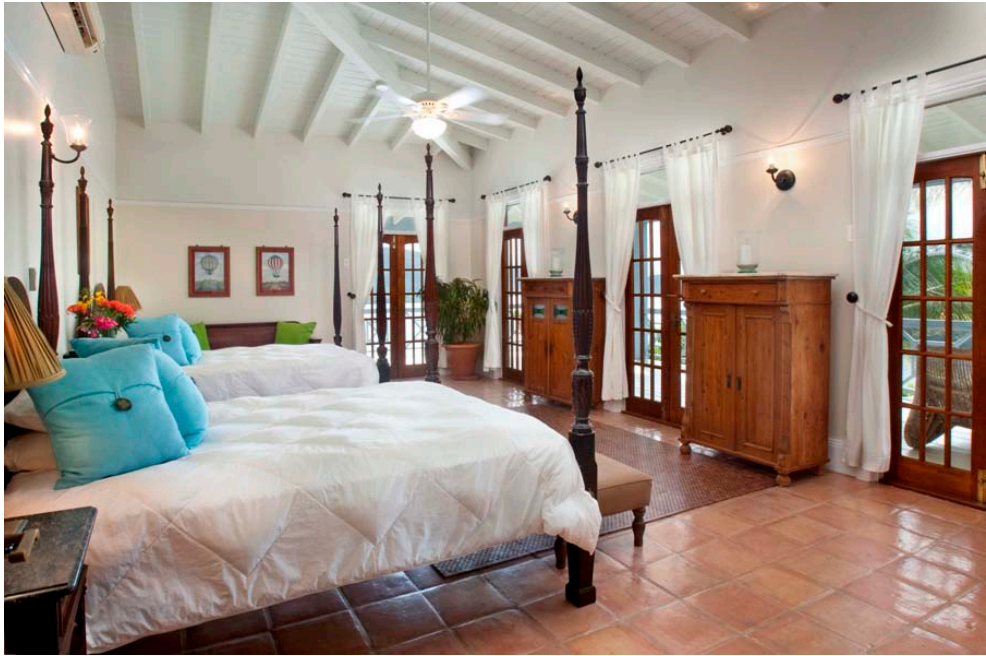
Guest Suite I