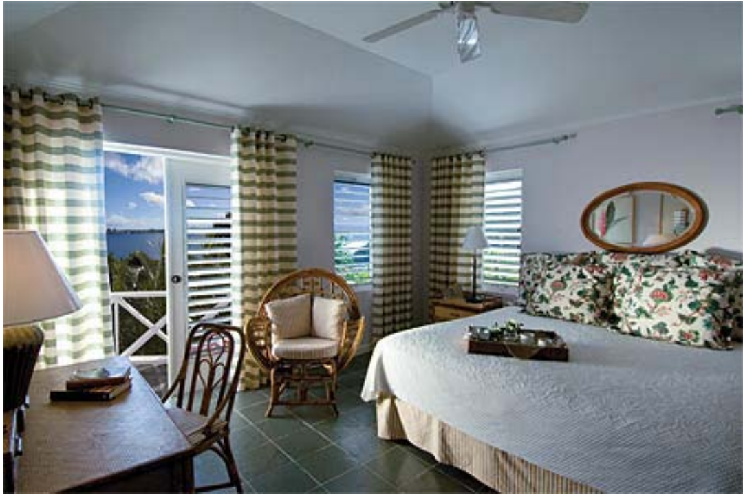
Guest Suite I