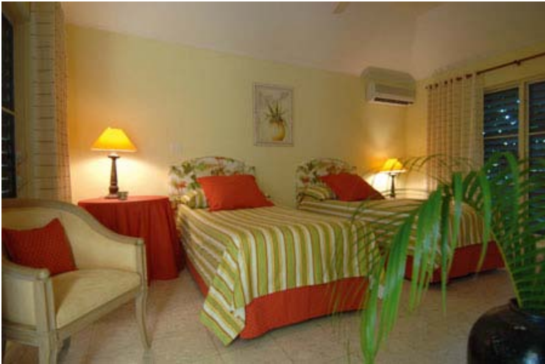
Guest Suite II