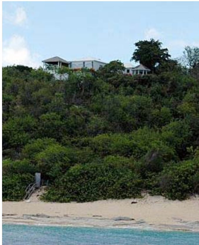
View of House from Beach