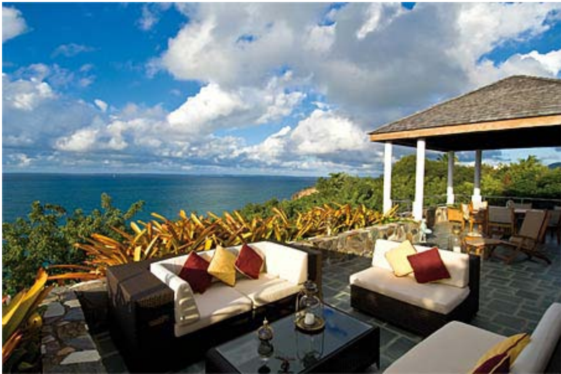
Outside Views of Ocean