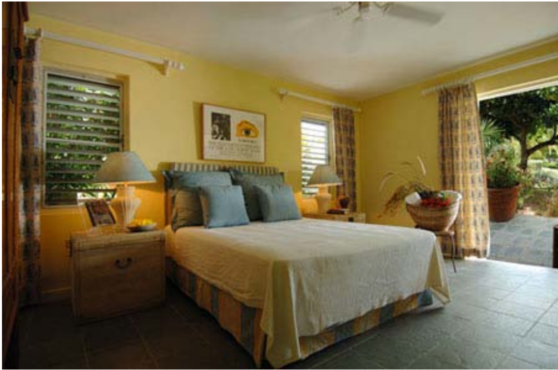
Guest Suite III