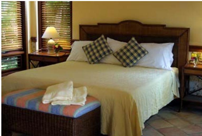
Guest Suite I