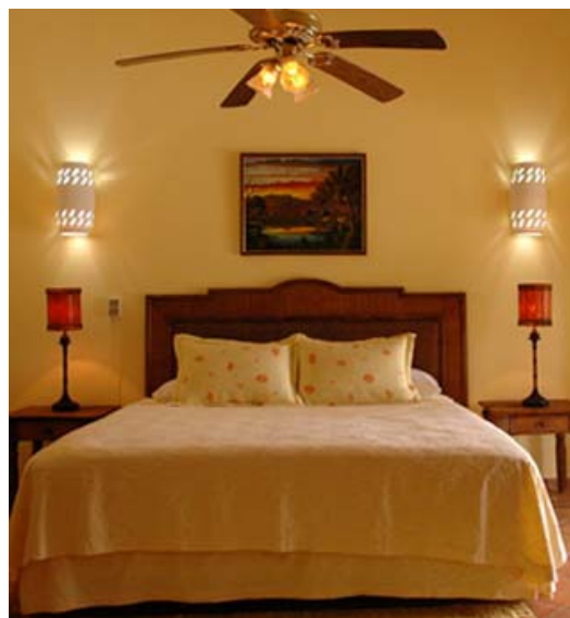
Guest Suite II