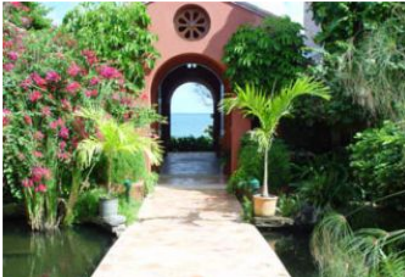
Passage to Gardens