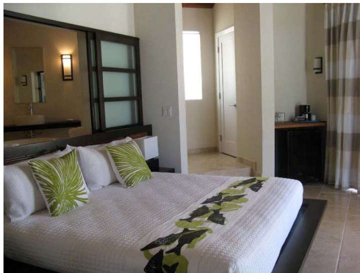
Bungalow I (Alternate View)