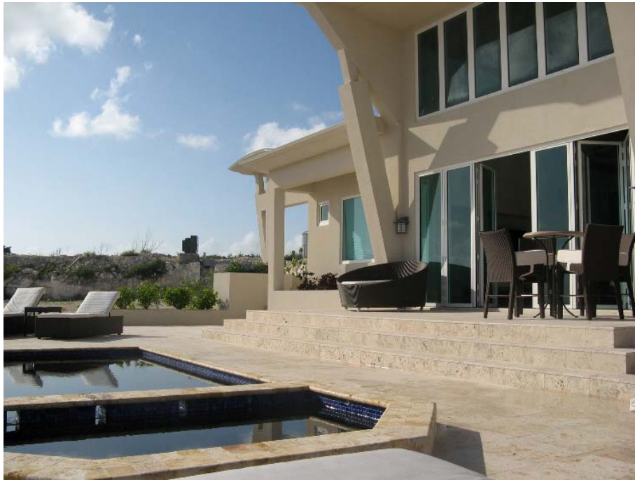
Patio (with Pool View)