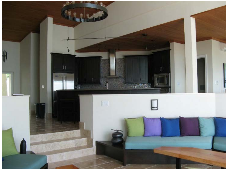
Living Area (with Kitchen View)