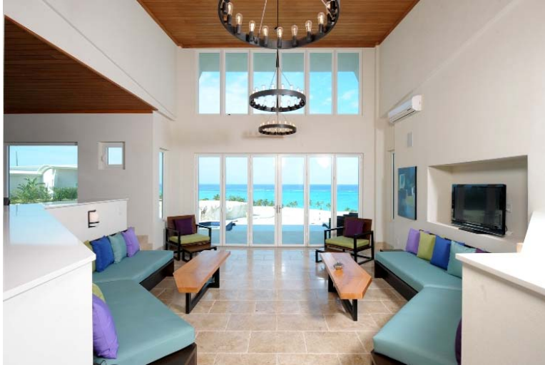
Living Area (Great Room)