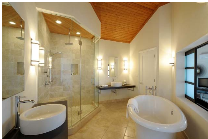
Bungalow I Bathroom