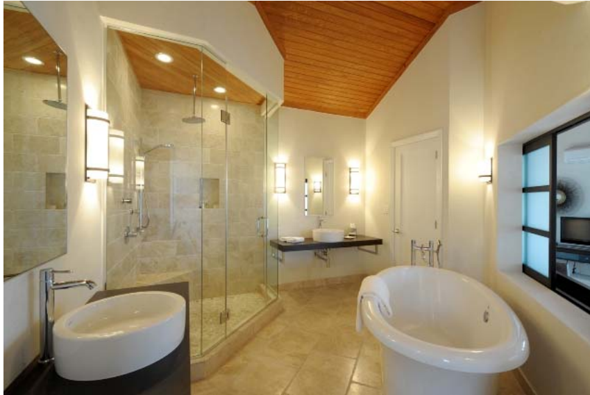
Bungalow I – Bathroom