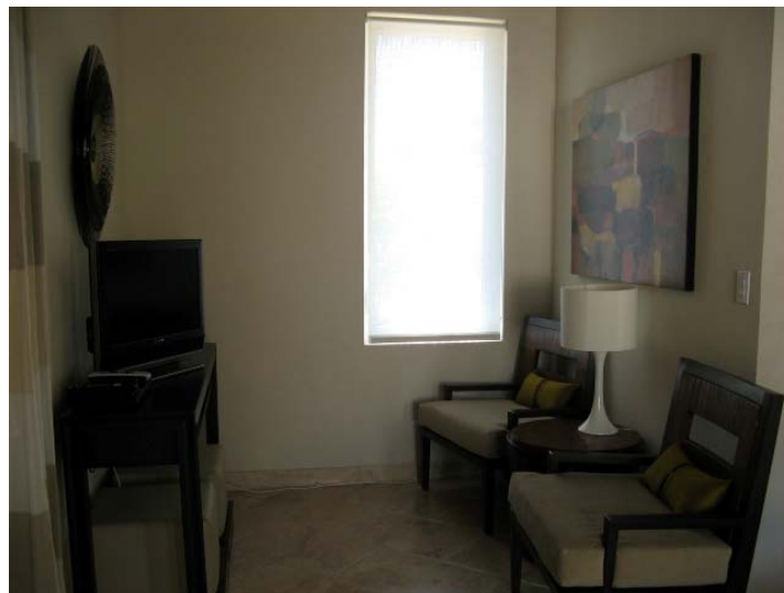
Bungalow I – Lounge Area