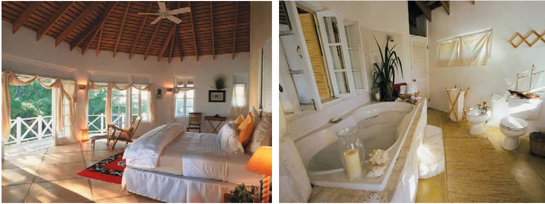
Cottage with Private Bath