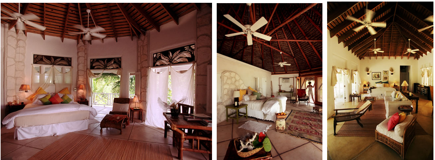
Villa Suites with living rooms and dining areas and pool