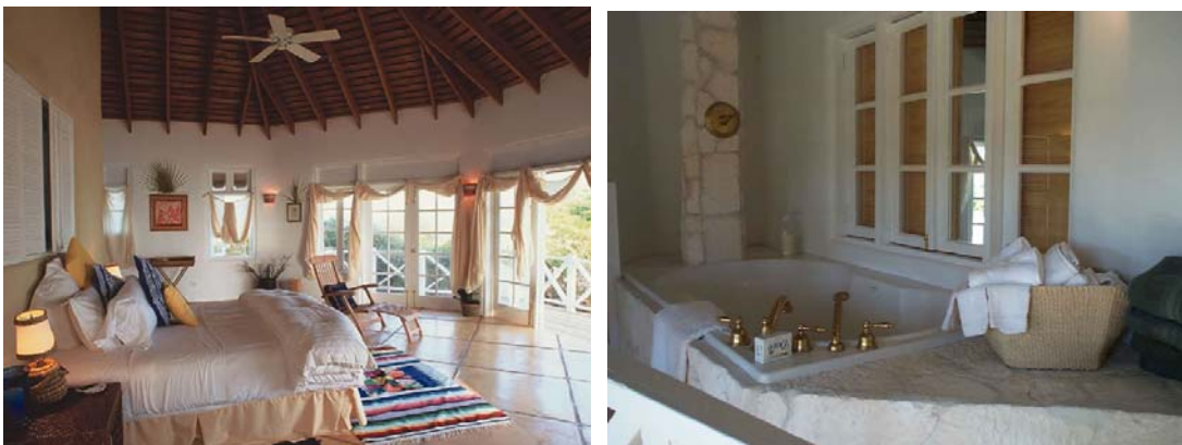
Second Cottage with Private Bath