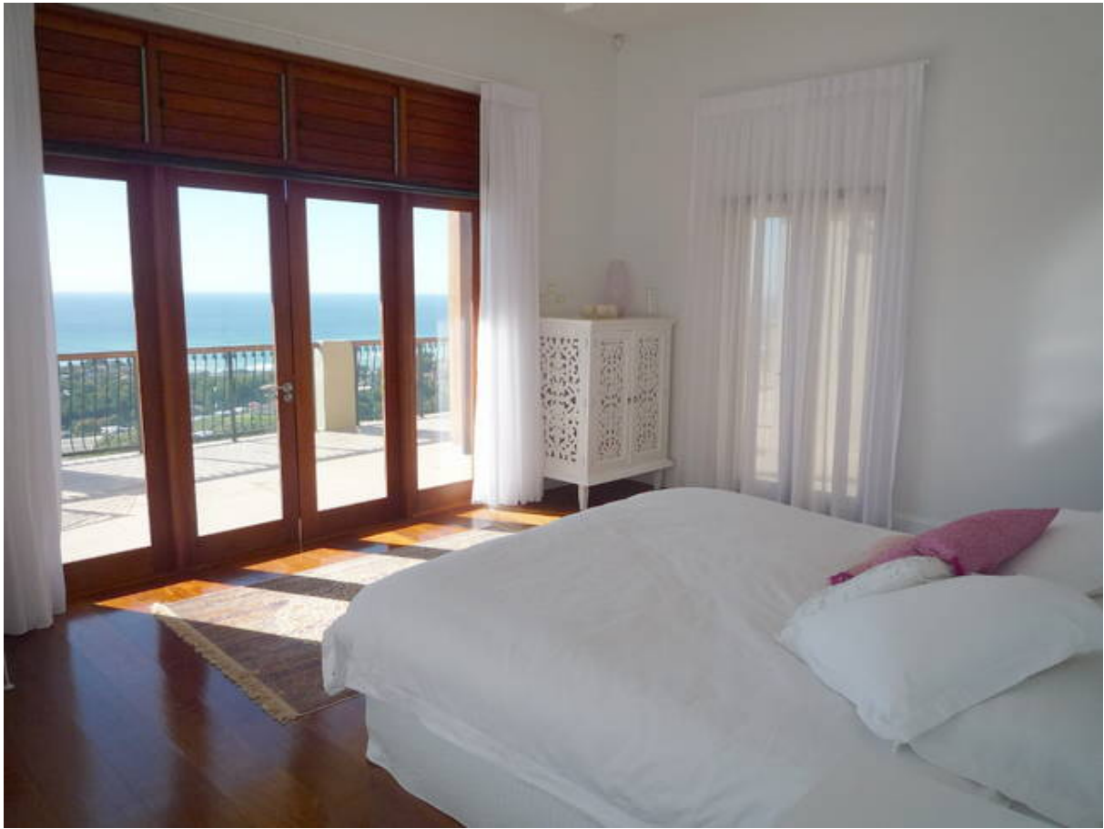
Guest Suite III