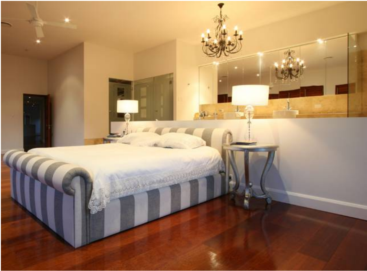
Guest Suite II