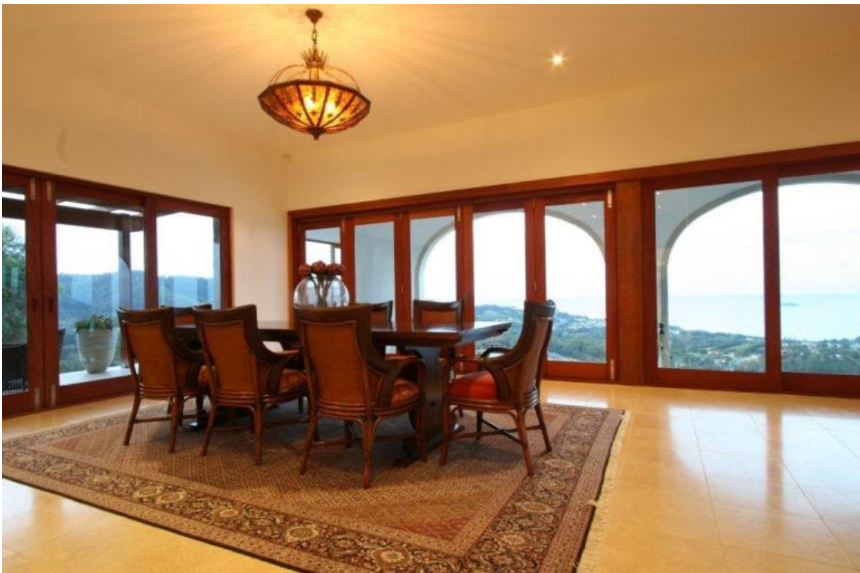
Views of Ocean from Dining Area