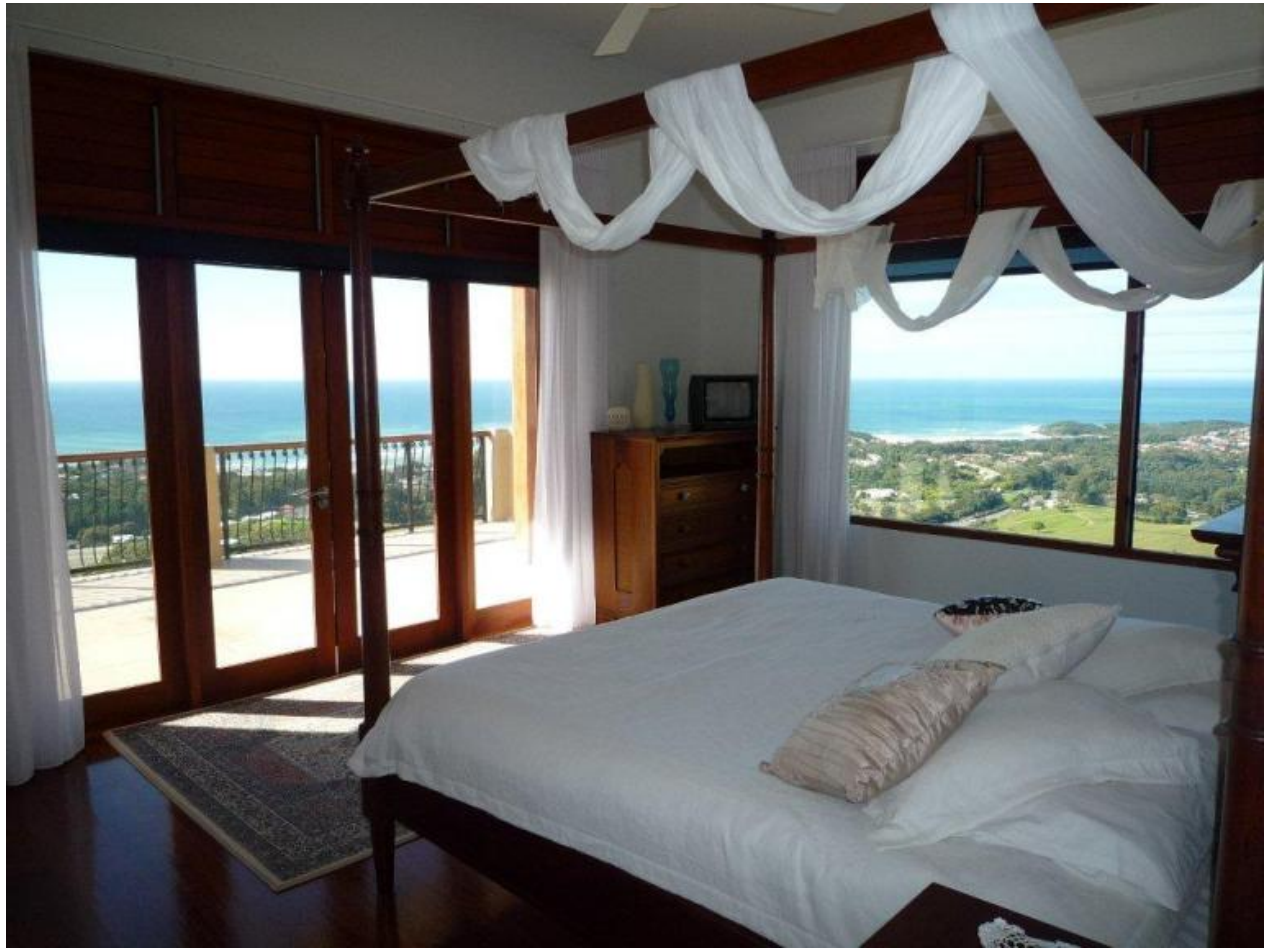
Guest Suite I