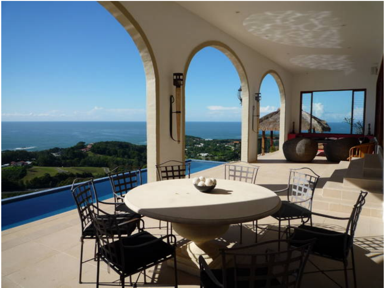
Views from Outside Dining