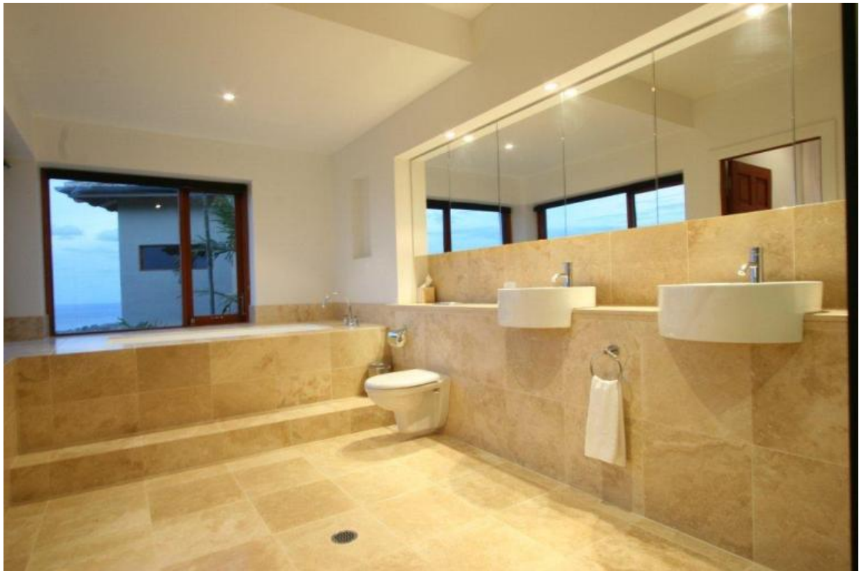
Guest Bath II